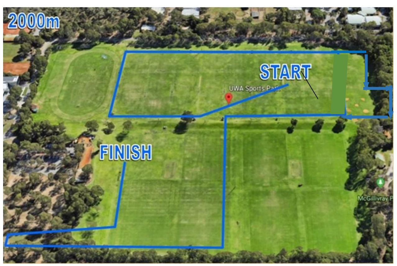
2000m Course Map Year 3 & 4