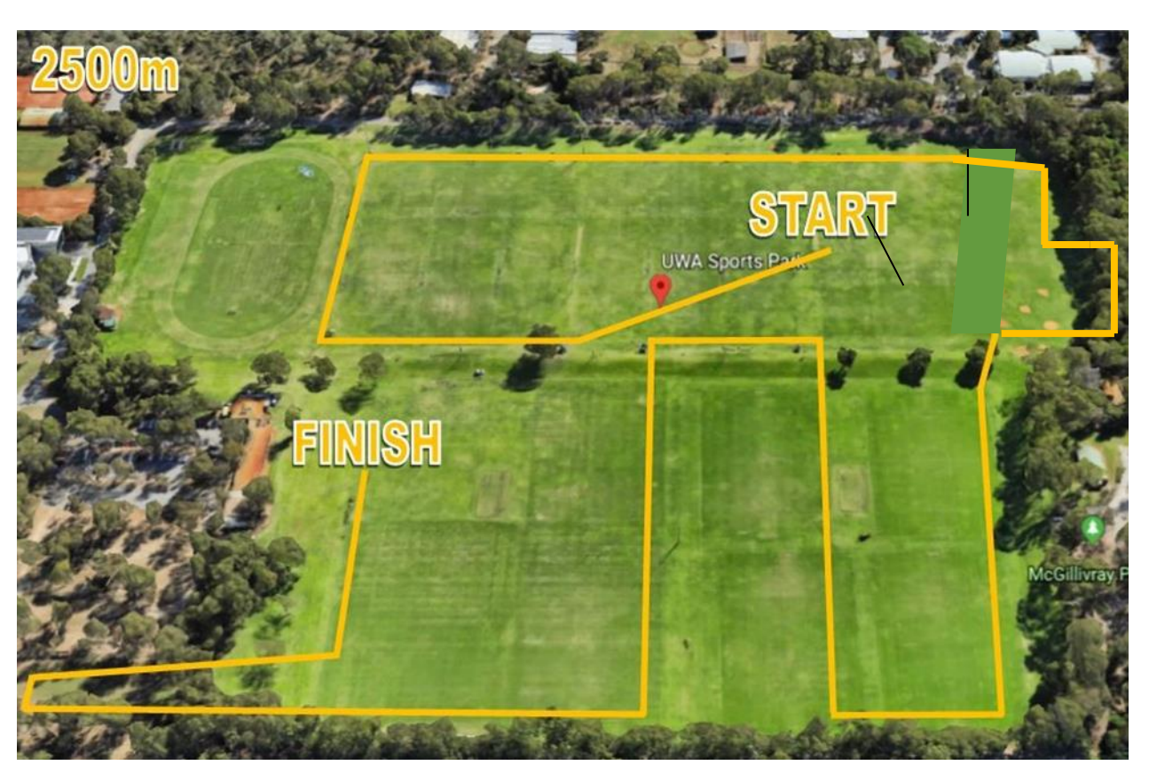
2500m Course Map Year 5 and Year 6